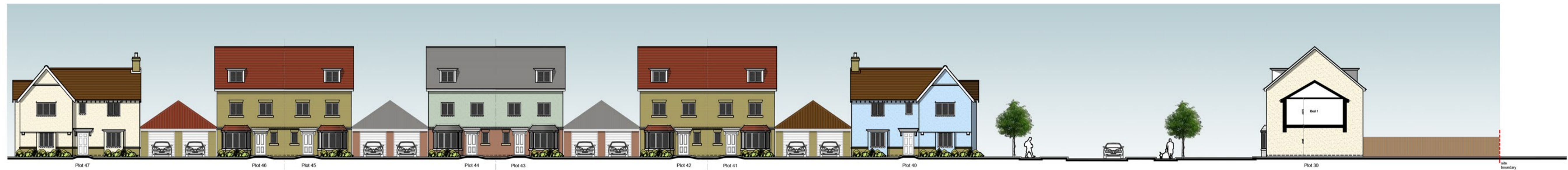
Street Scene C-C