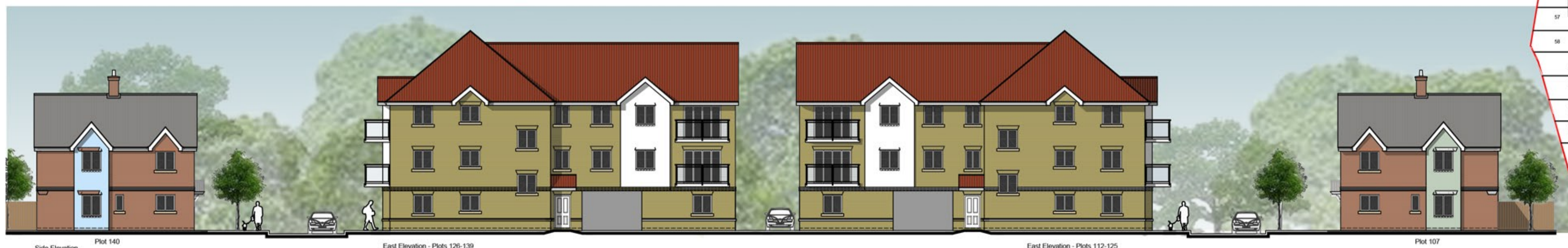
Street Scene D-D