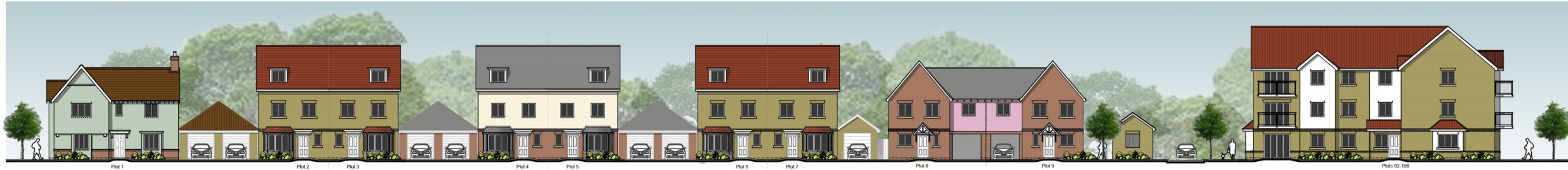
Street Scene A-A