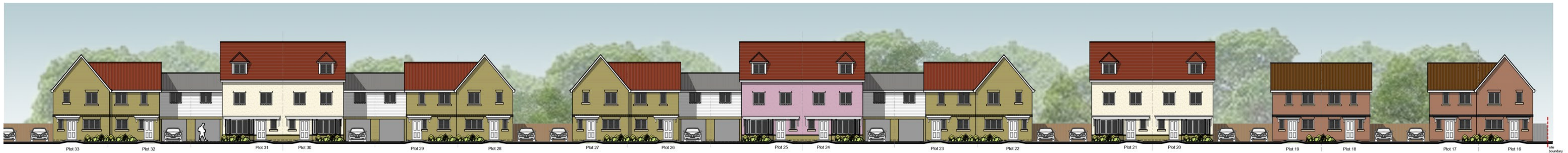
Street Scene B-B